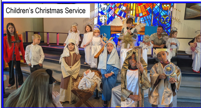
Children's Christmas Service